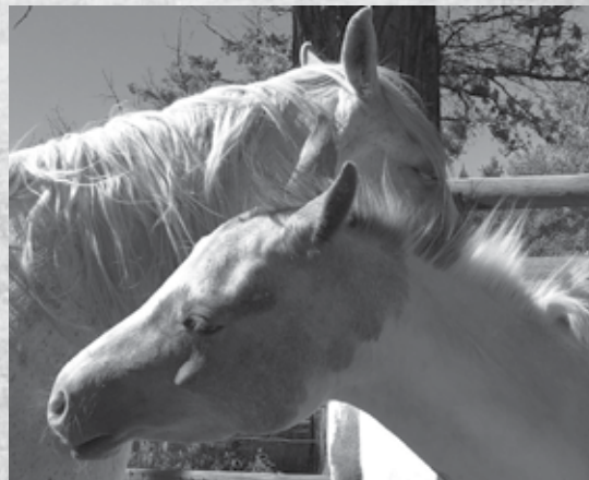
NAKIA (AND BETHLEHEM)

Rescued from slaughter, Nakia’s gaunt frame bore witness to her lack of nourishment during vital growing stages in her young life. Once at the Ranch, Nakia joyously reunited with her mother, Bethlehem, our grey Arabian who arrived a year prior. The new filly made an immediate connection to one little girl in particular. This child had endured homelessness and hunger. She lived two weeks on the streets without food. And, she suffered through devastating separation from her mother. Parallel to Nakia’s recovery, this beloved daughter is also currently experiencing the hope and redemption of Jesus Christ in her own life and family.